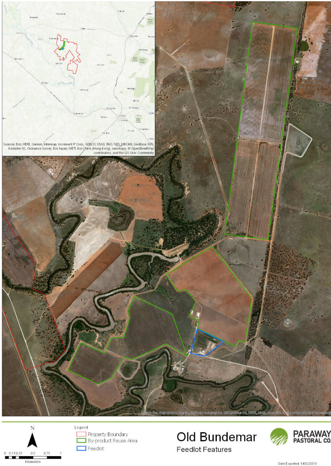
Figure 2 Site Features